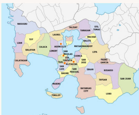
Agoncillo, Alitagtag, San Nicolas and Sta. Teresita municipalities in the Batangas Province